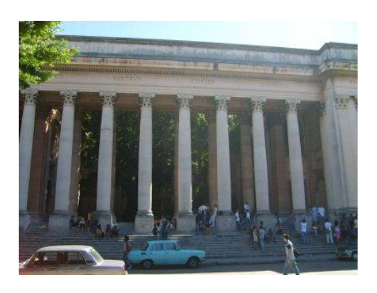
Facultad de Matemática y Computación